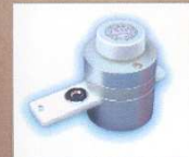
C-52 Sample Chamber